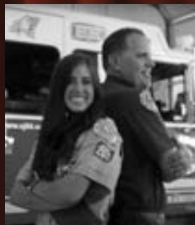
Scouting On The Frontlines Of The Pandemic 2020