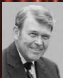
William Hewlett* 1977